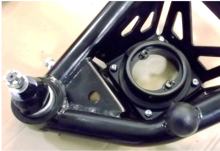
Figure 1 (P/N 7720-168)