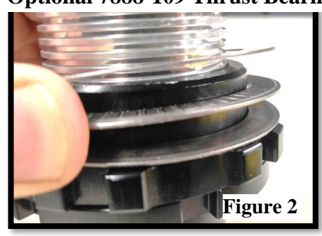
Optional 7888-109 Thrust Bearing