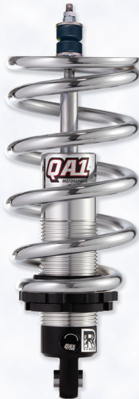
MR301 with Spring